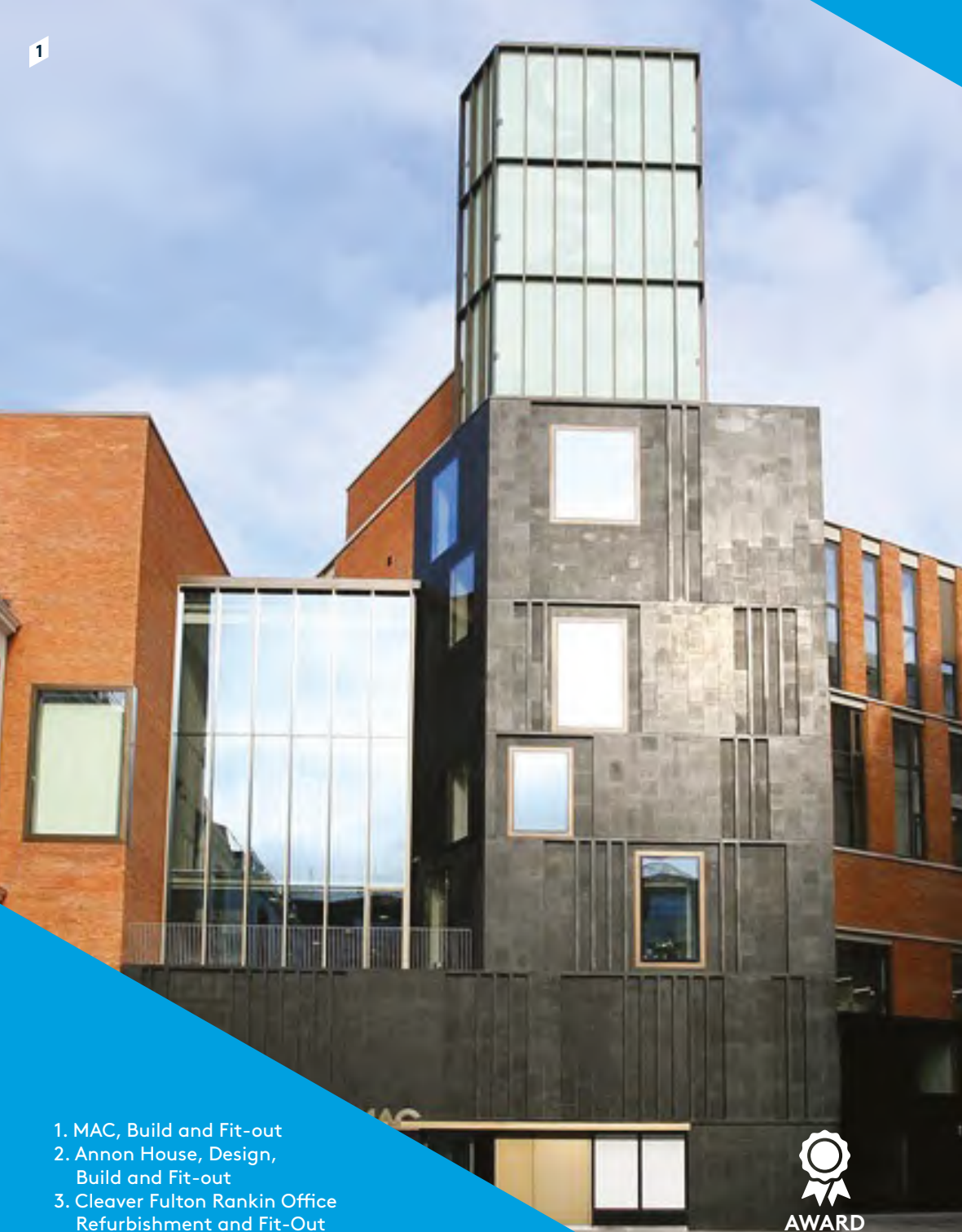
1. MAC, Build and Fit-out 2. Annon House, Design, Build and Fit-out 3. Cleaver Fulton Rankin Office Refurbishment and Fit-Out