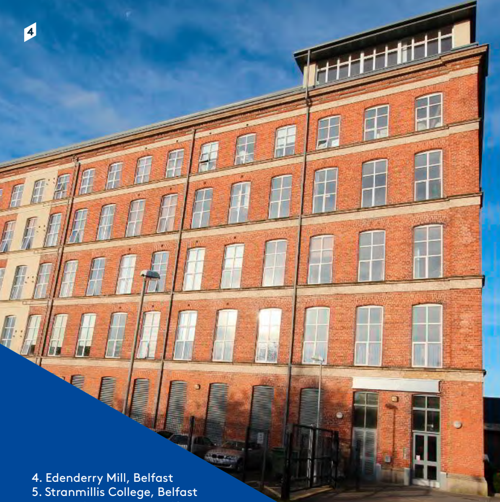
4. Edenderry Mill, Belfast 5. Stranmillis College, Belfast 6. Queen's University, Belfast 7. Cleaver Fulton Rankin Office Refurbishment and Fit-Out