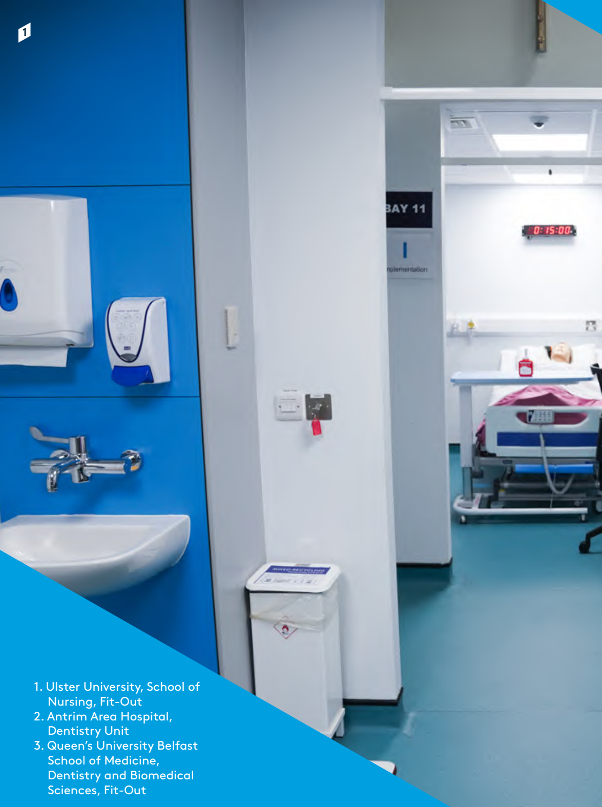
1. Ulster University, School of Nursing, Fit-Out 2. Antrim Area Hospital, Dentistry Unit 3. Queen's University Belfast School of Medicine, Dentistry and Biomedical Sciences, Fit-Out